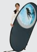
MEDIUM HORIZONTAL A-FRAME